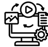
MANAGEMENT AND MEDIA