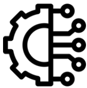
ENGINEERING AND TECHNOLOGY

20–23 December 2024, Westford University College, Al Zahia Campus, Sharjah, UAE